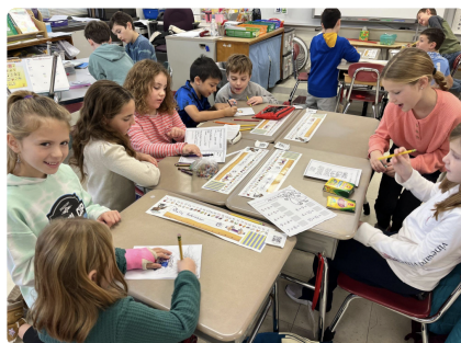
1st & 4th Grade Buddy Classes