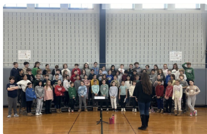
Concert Rehearsal in 5th Grade

Norwell Public Schools is now accepting registrations for community preschoolers for the 2024-2025 Preschool Lottery. Any preschooler who will be 3 or 4 before September 1, 2024 is eligible to enter the lottery. Visit our website HERE to learn more.