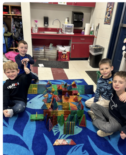
K Proudly Displays their Creation